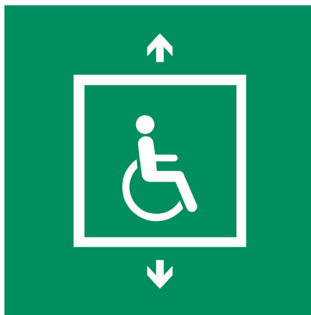
Figure 1 — Safety sign “Evacuation lift for people unable to use stairs”, ISO 7010-E070

The evacuation lift shall be indicated with an evacuation lift sign according to Figure 1 on every landing intended to be served during the evacuation operation. The location of the sign shall be according to EN 81-70:2021+A1:2022, 5.4.3.3 c) and the minimum size of the sign shall be 40 mm × 40 mm.