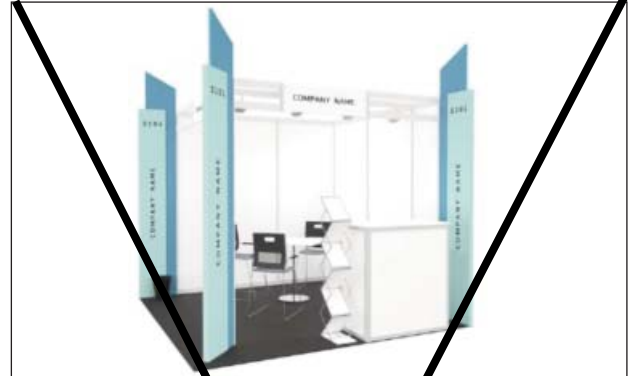
Illustration: Corner booth

Please note: Above prices are excluding VAT which will be applied on invoice as applicable.