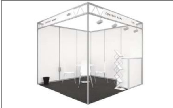
Illustration: Corner booth